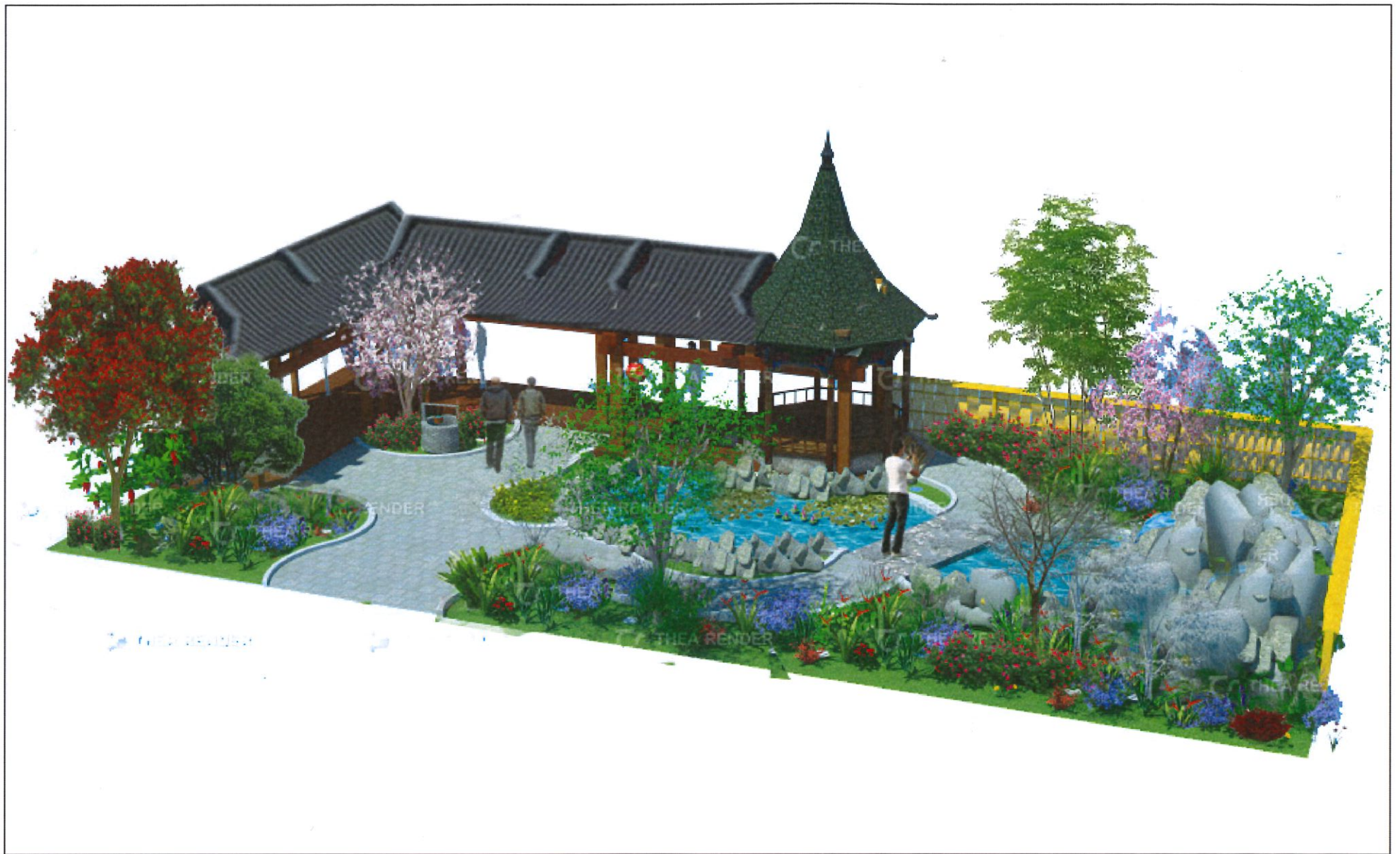
Yi Garden - Friendship Garden ; Bloom in the Park 2016 Designed by Meng Pan